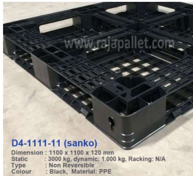
Fig 4. Pallet dimensions of 1100 mm x 1100 mm

The required number of pallets was determined based on the quantity of hazardous and toxic waste packaging generated, as well as the storage capacity of each pallet. Each type of waste was grouped according to its hazardous characteristics to ensure proper storage management and compliance with hazardous waste storage requirements. The total number of generated hazardous and toxic waste drums is 97 units, consisting of 60 drums classified as toxic and 28 drums classified as ignitable. To anticipate additional requirements, a 10% reserve was added to each waste category. For waste with toxic characteristics, the number of drums increased to 66 units after adding the reserve. By applying a two-layer stacking system, the effective number of drums becomes 33 units. Given that each pallet can accommodate 4 drums, the required number of pallets is 9 units.