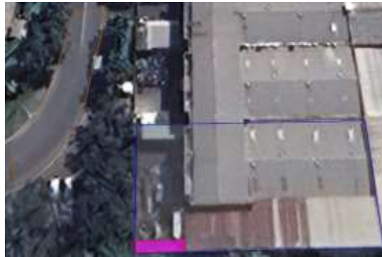
Fig. 3. Location of Temporary Storage