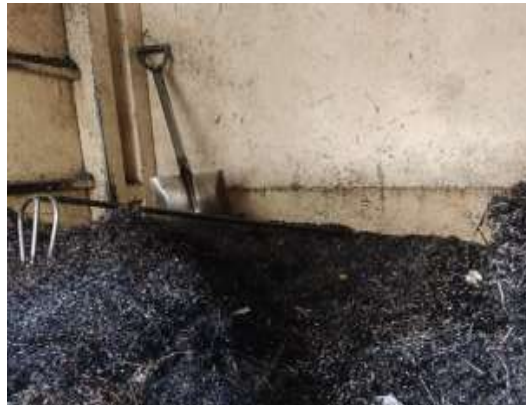
Fig. 2. Existing Condition of Temporary Storage

PT XYZ is a manufacturing company operating in Cikarang, Bekasi Regency. The company is engaged in the production of components and spare parts for machinery and turbines, as well as components and accessories for two and three wheeled motorcycles. Its operational activities include machining processes, fabrication, and the assembly of mechanical components that support various industrial sectors.